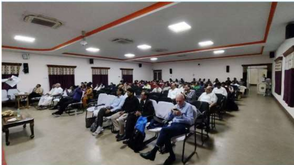
Afternoon Sessions Proceeding on Day 3 – 23/02/2024