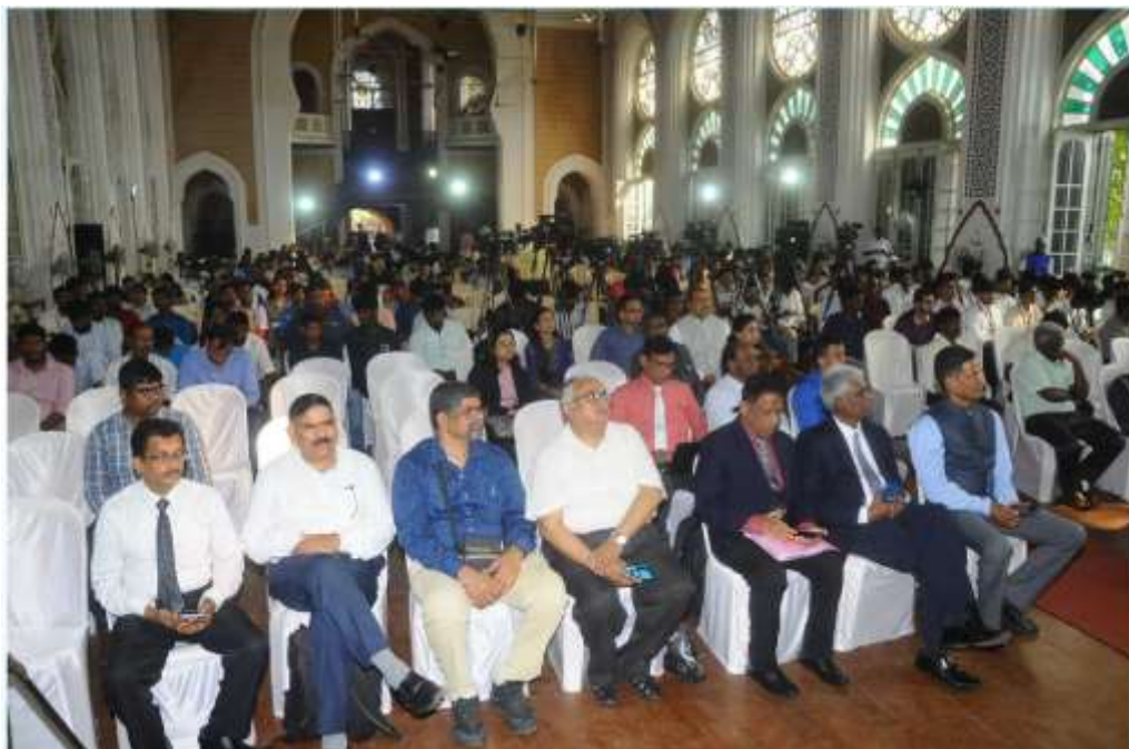
Guests, Resource Persons, Participants for International Conference