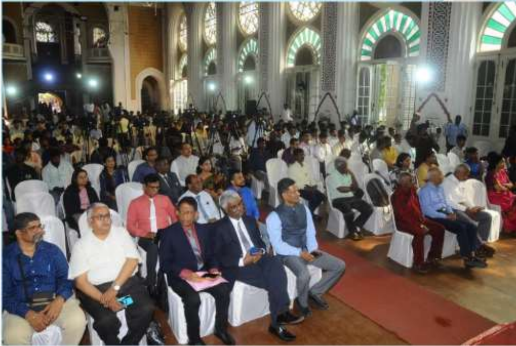
Guests, Resource Persons, Participants for International Conference