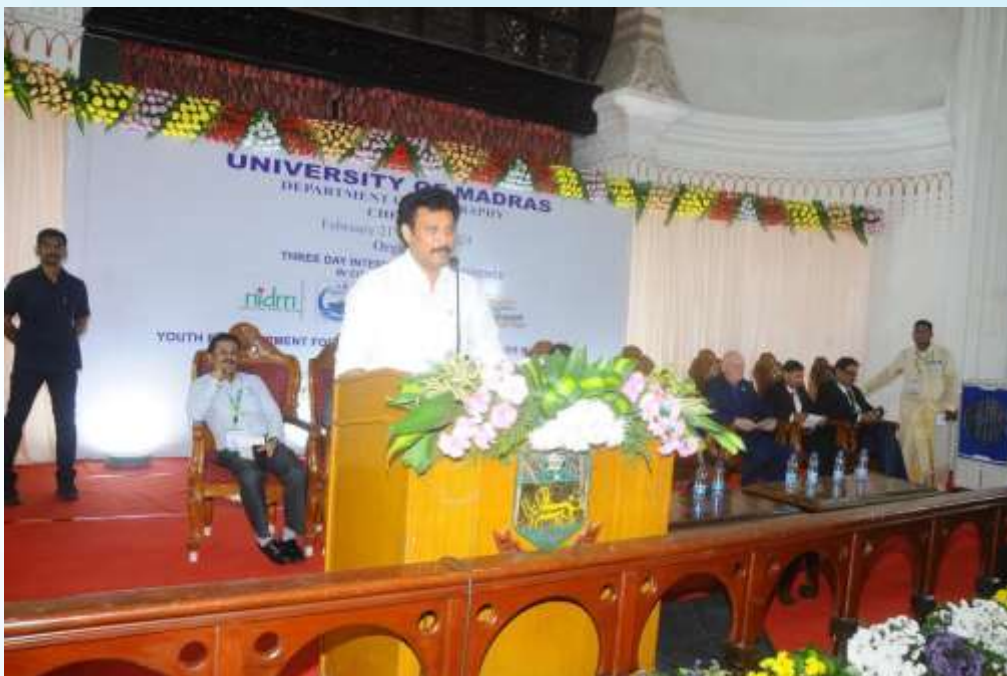
Speech by Thiru Anbil Mahes Poyamozhi Minister for School Education, Govt. Of Tamil Nadu