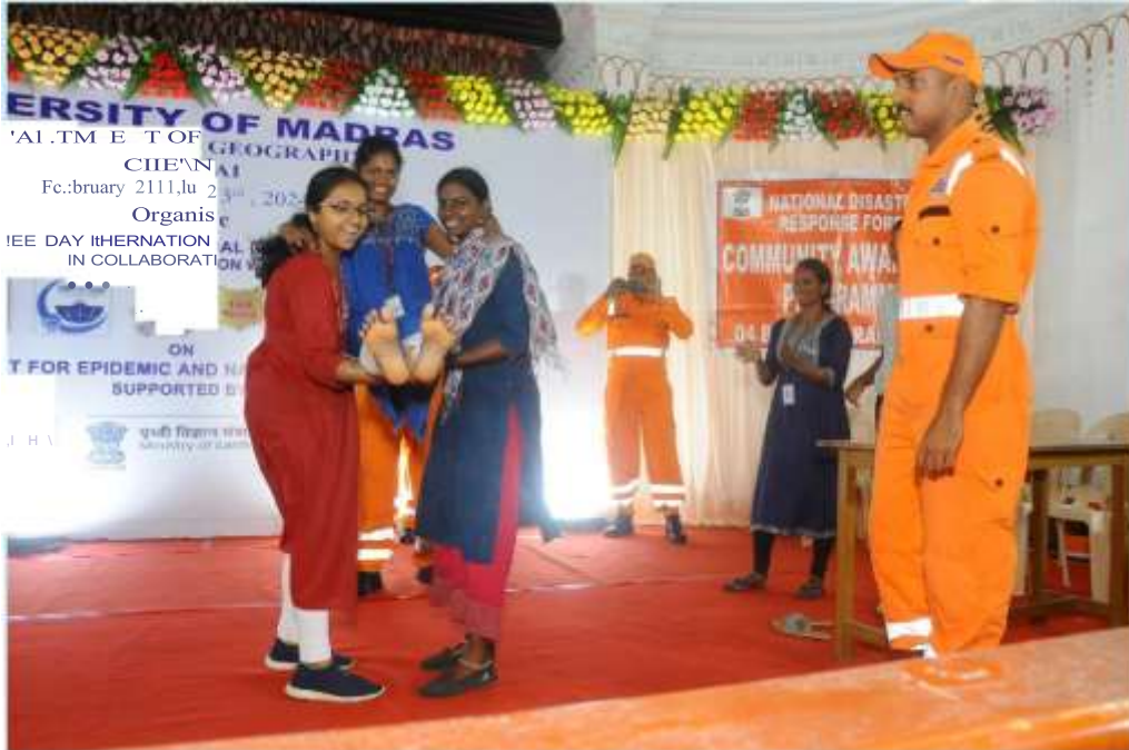
NDRF Person training Participants

NDRF Demonstration Session for Awareness for Disaster Management