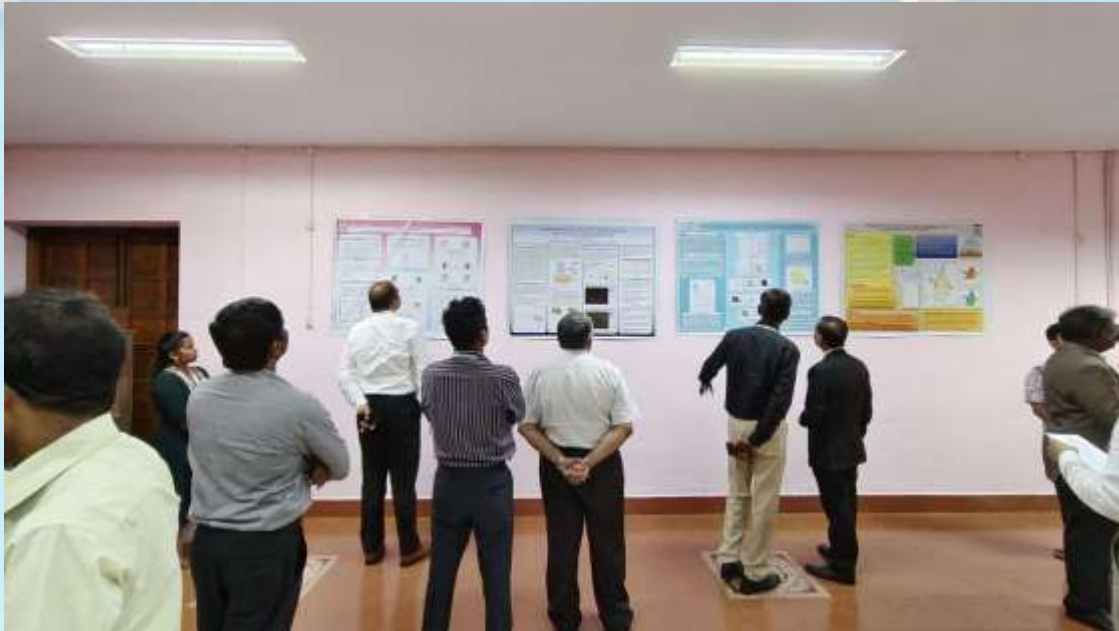
Guest Inspecting – Poster Presentation Demonstrated by M.Tech and M.Sc. Students On Day 3 – 23/02/2024