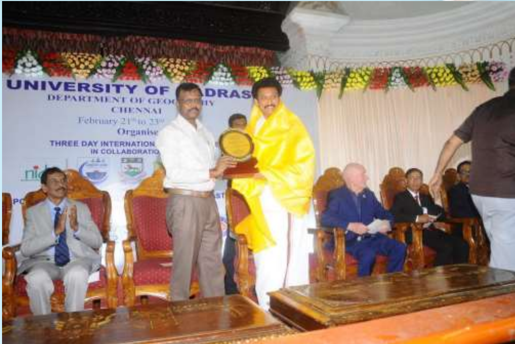
Facilitating Honorable Minister Anbil Mahes Poyamozhi, Minister of School Education, TN Gov