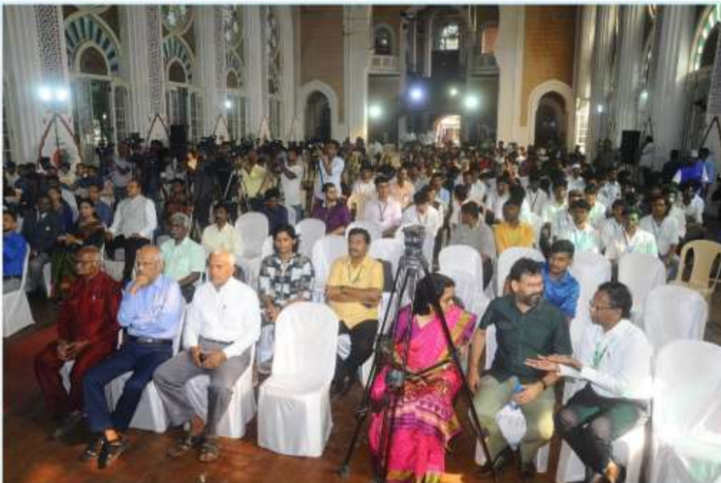
Guests, Resource Persons, Participants for International Conference