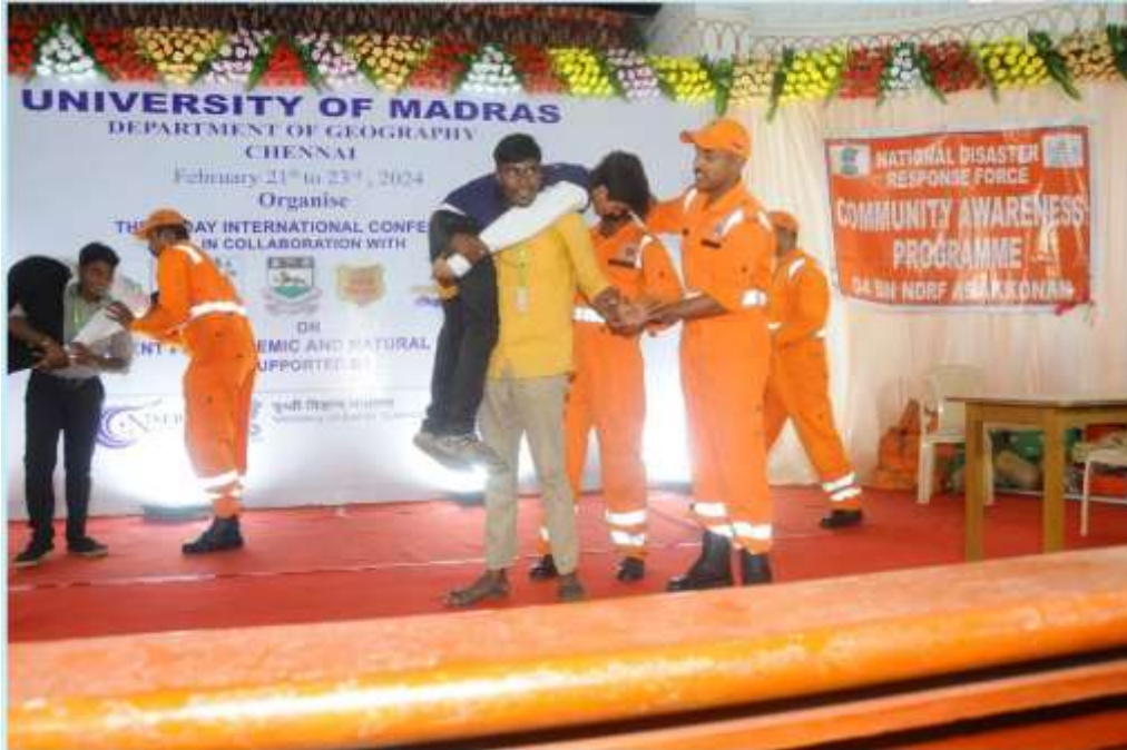
NDRF Person training Participants

NDRF Demonstration Session for Awareness for Disaster Management