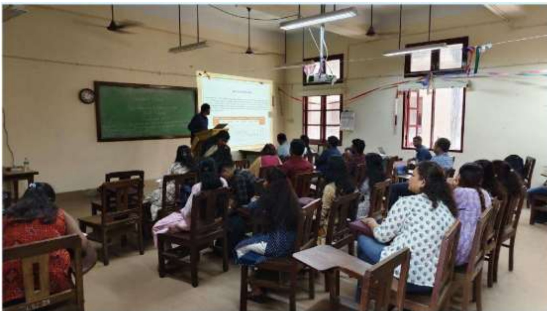
Morning Sessions Proceeding on Day 2 – 22/02/2024