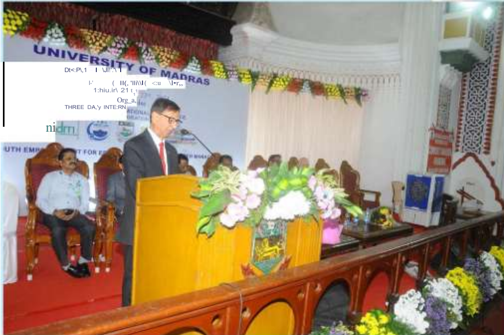
Speech by Guest of Honor