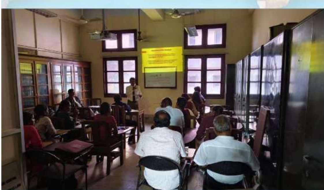
Afternoon Sessions Proceeding on Day 2 – 22/02/2024