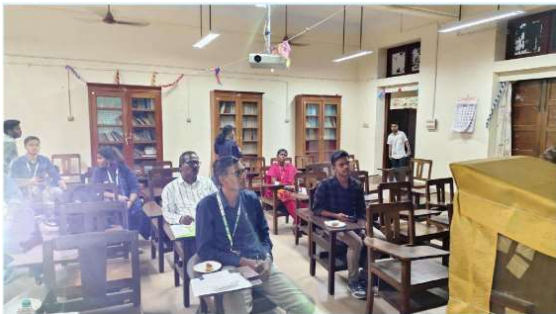
Evening Sessions Proceeding on Day 2 – 22/02/2024