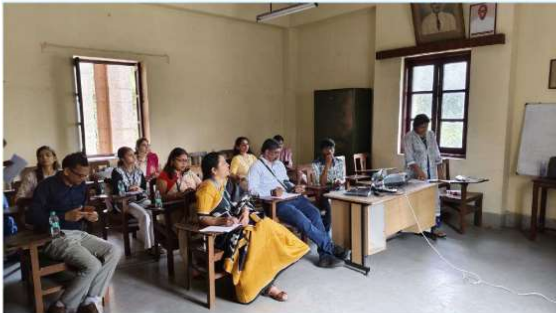
Morning Sessions Proceeding on Day 2 – 22/02/2024