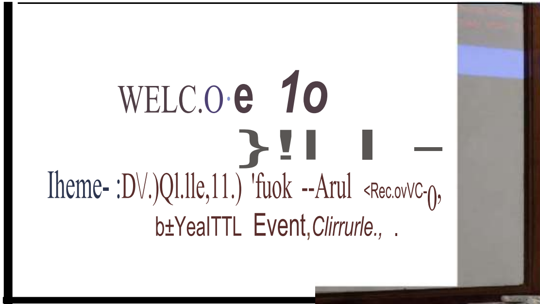
Morning Sessions Proceeding on Day 2 – 22/02/2024