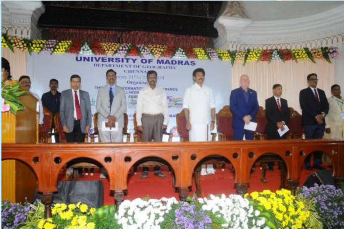
Inauguration Programme, on Day 1 (21/02/2024)