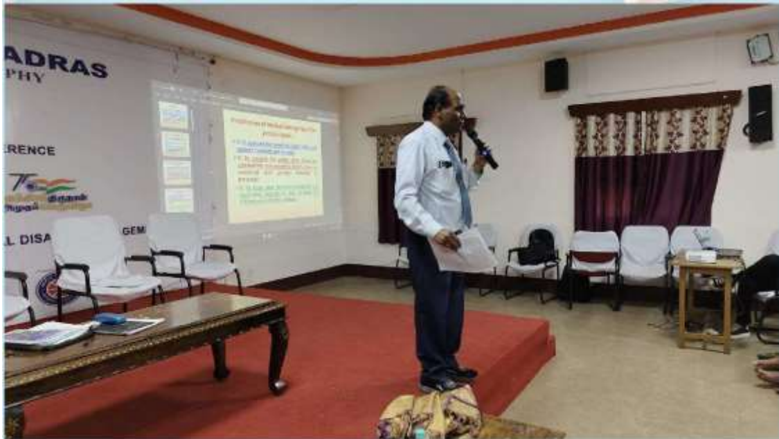
Afternoon Sessions Proceeding on Day 2 – 22/02/2024