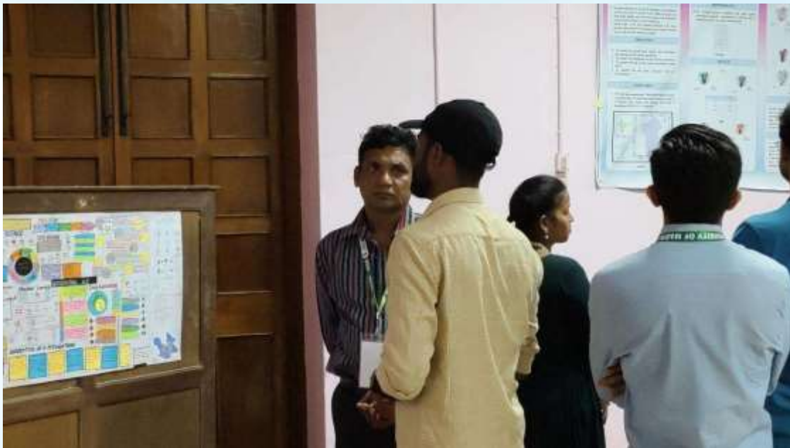
Students Exhibiting their Research Work on Day 3 – 23/02/2024