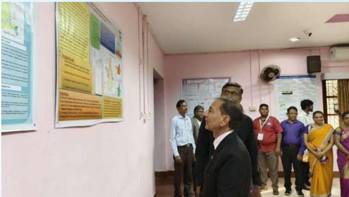
Guest Inspecting – Poster Presentation Demonstrated by M.Tech and M.Sc. Students On Day 3 – 23/02/2024