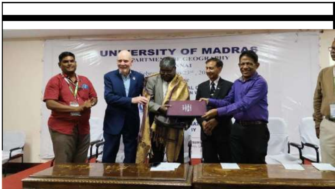
Presenting Files and Bag for Guest, Valedictory Programme