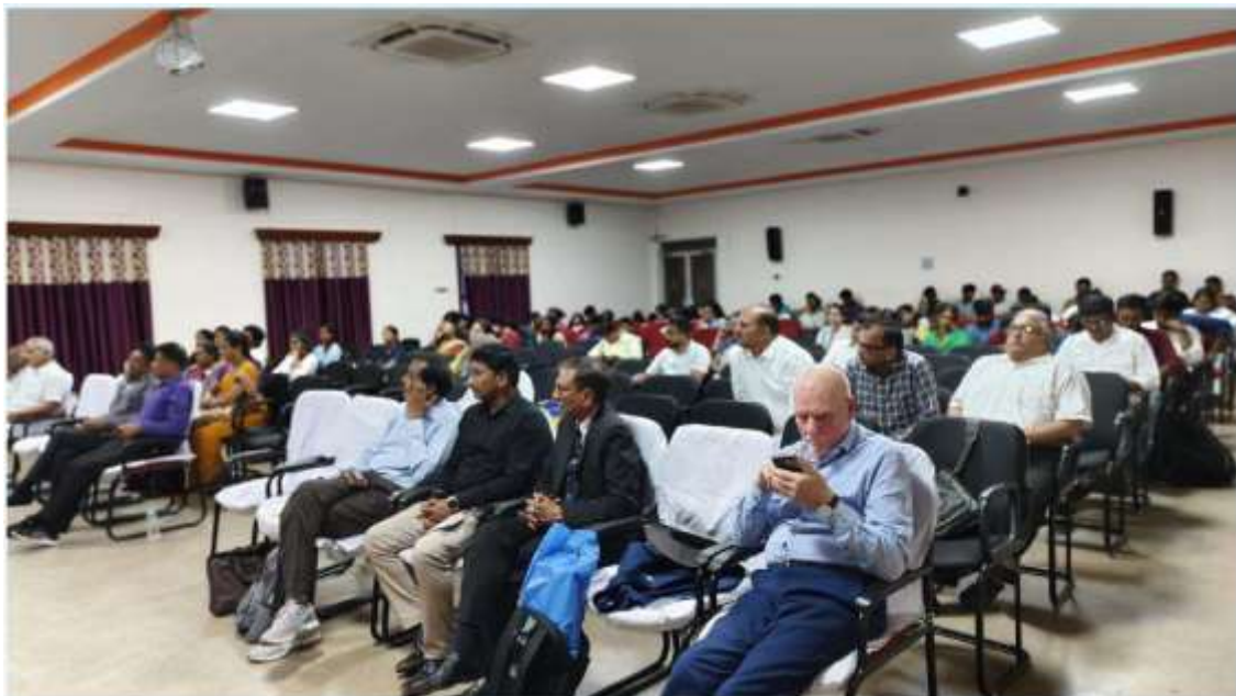
Afternoon Sessions Proceeding on Day 2 – 22/02/2024