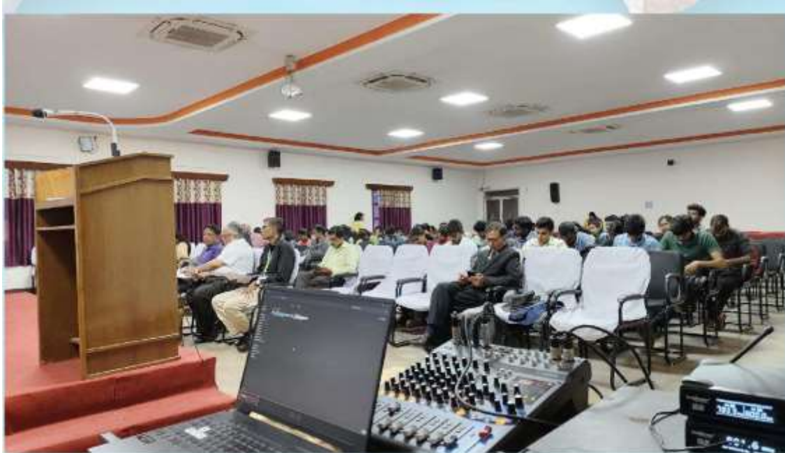
Afternoon Sessions Proceeding on Day 3 – 23/02/2024