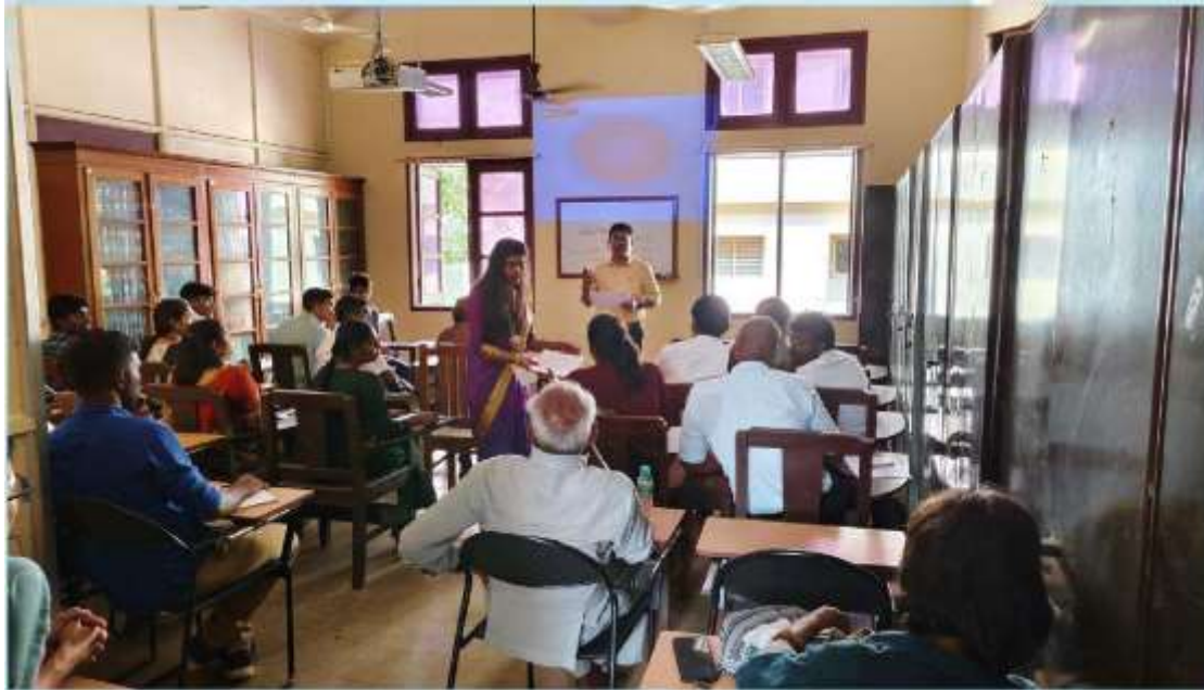
Morning Sessions Proceeding on Day 2 – 22/02/2024