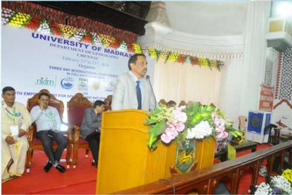
Speech by Guest of Honor