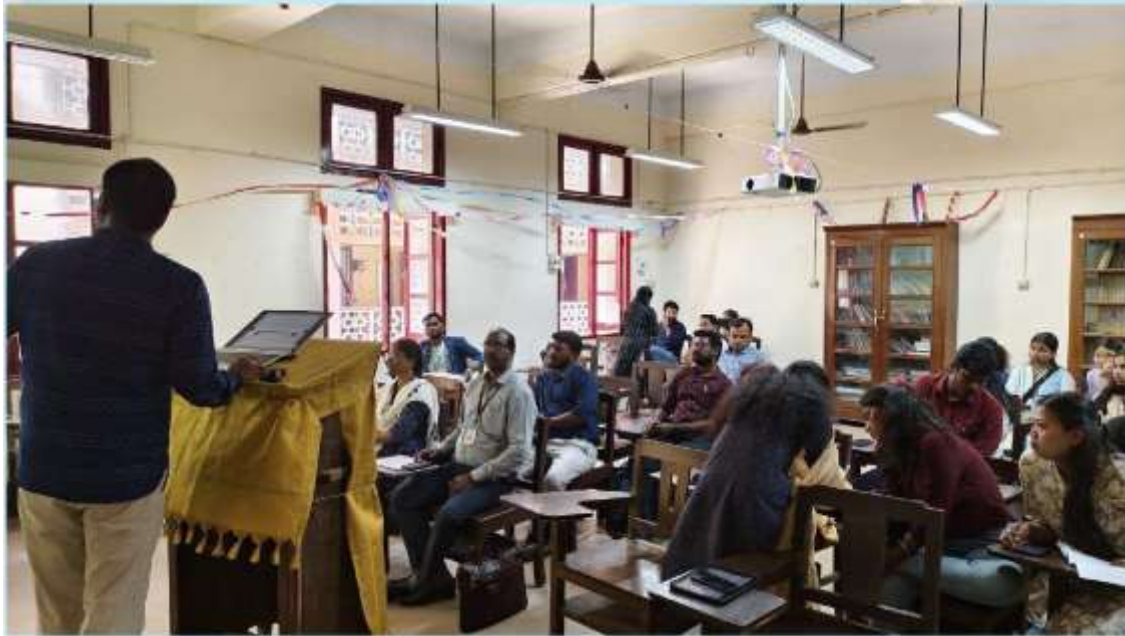
Morning Sessions Proceeding on Day 2 – 22/02/2024