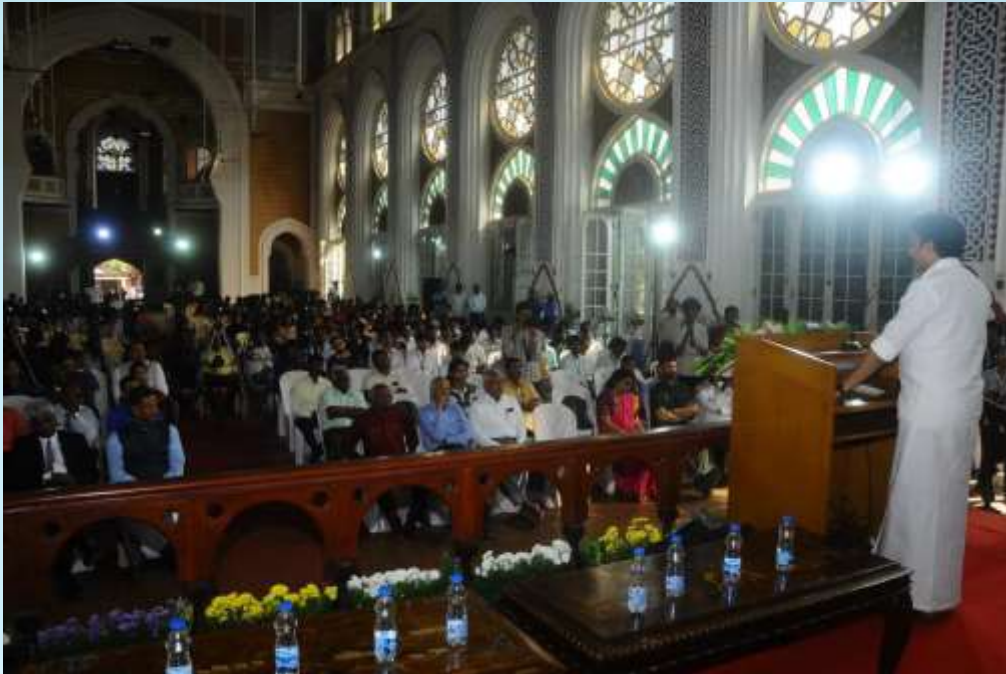
Speech by Thiru Anbil Mahes Poyamozhi Minister for School Education, Govt. Of Tamil Nadu