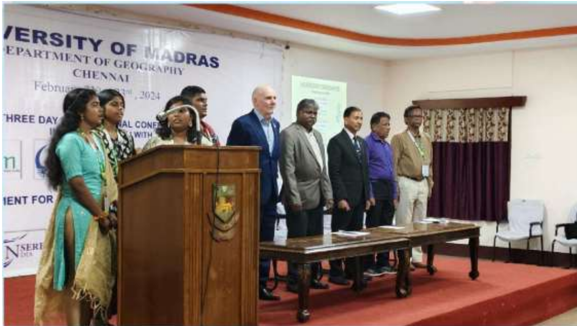
Inauguration of Valedictory Programme, on Day 3 (22/02/2024)