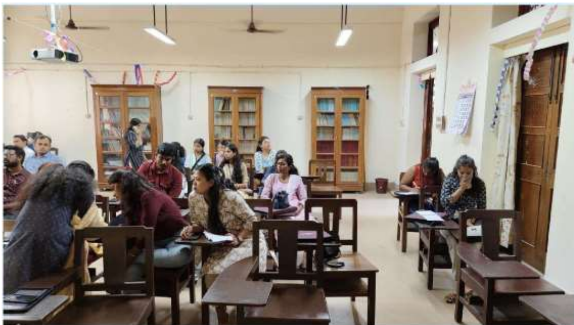
Morning Sessions Proceeding on Day 2 – 22/02/2024