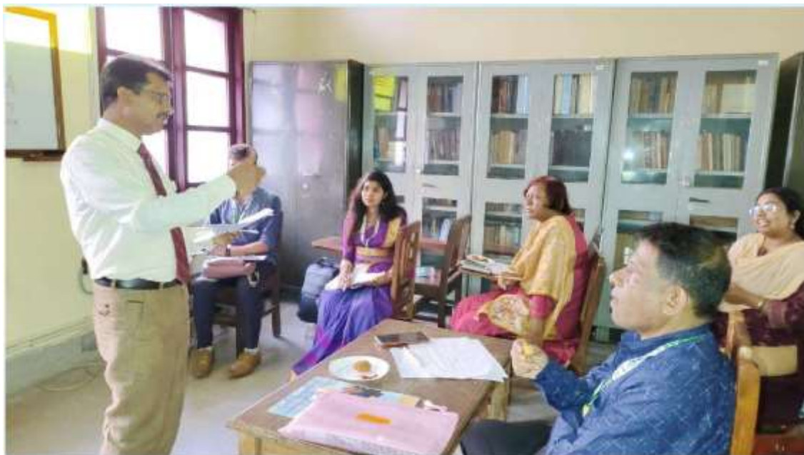
Afternoon Sessions Proceeding on Day 2 – 22/02/2024