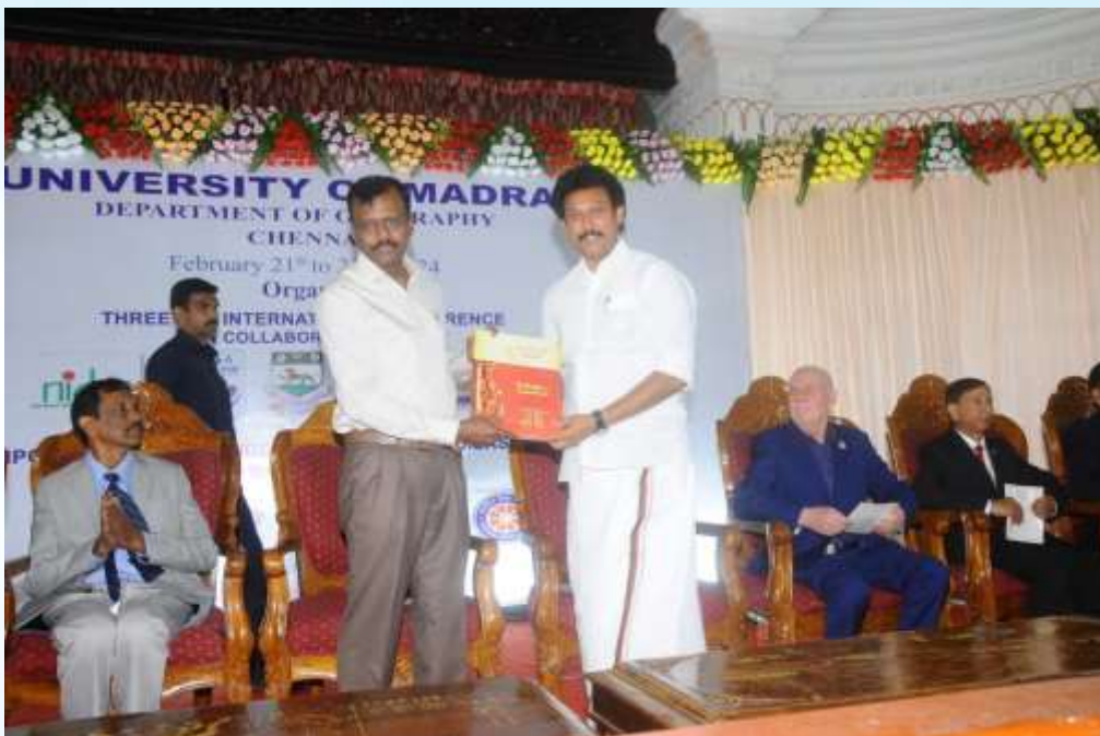
Release of Book by Honorable Minister Anbil Mahes Poyamozhi, Minister of School Education, Tamil Nadu Government.