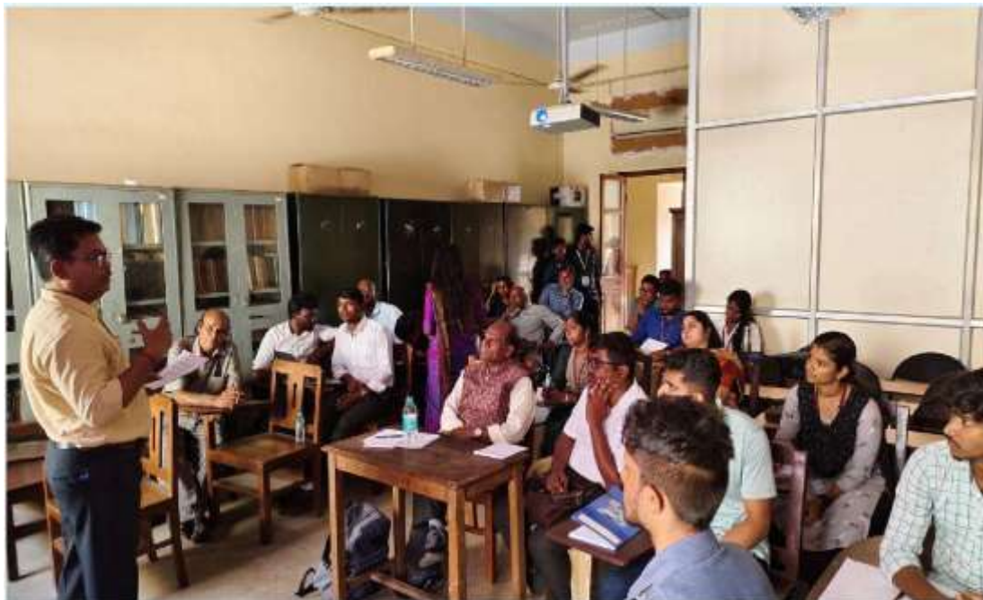
Morning Sessions Proceeding on Day 2 – 22/02/2024