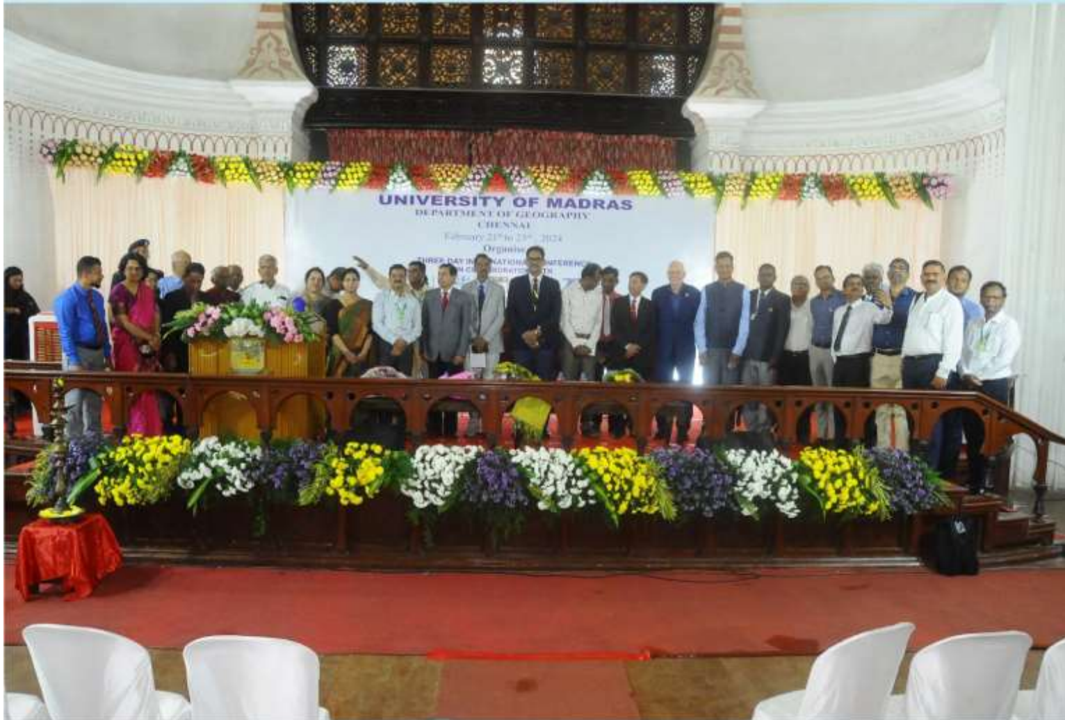
Closing Session of Inauguration Programme