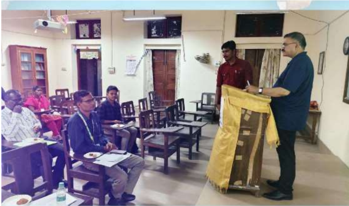
Evening Sessions Proceeding on Day 2 – 22/02/2024