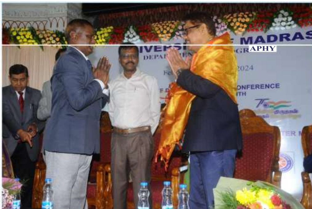
Facilitation of Guest of Honor