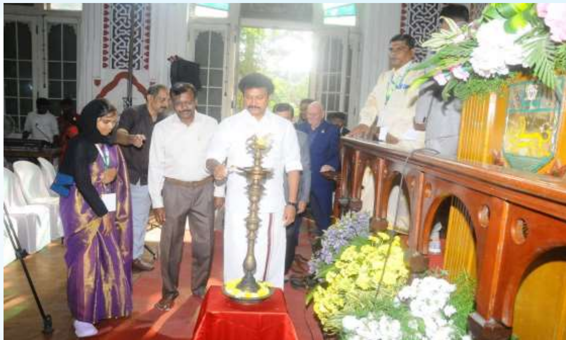
Lighting of Lamp by Thiru Anbil Mahes Poyamozhi, Honorable Minister for School Education