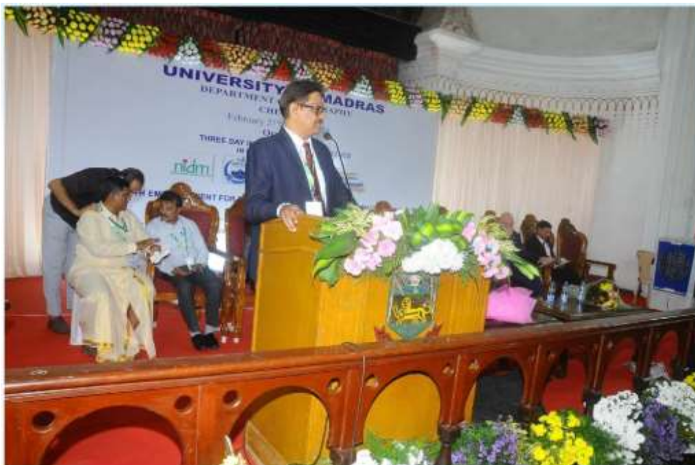
Speech by Guest of Honor