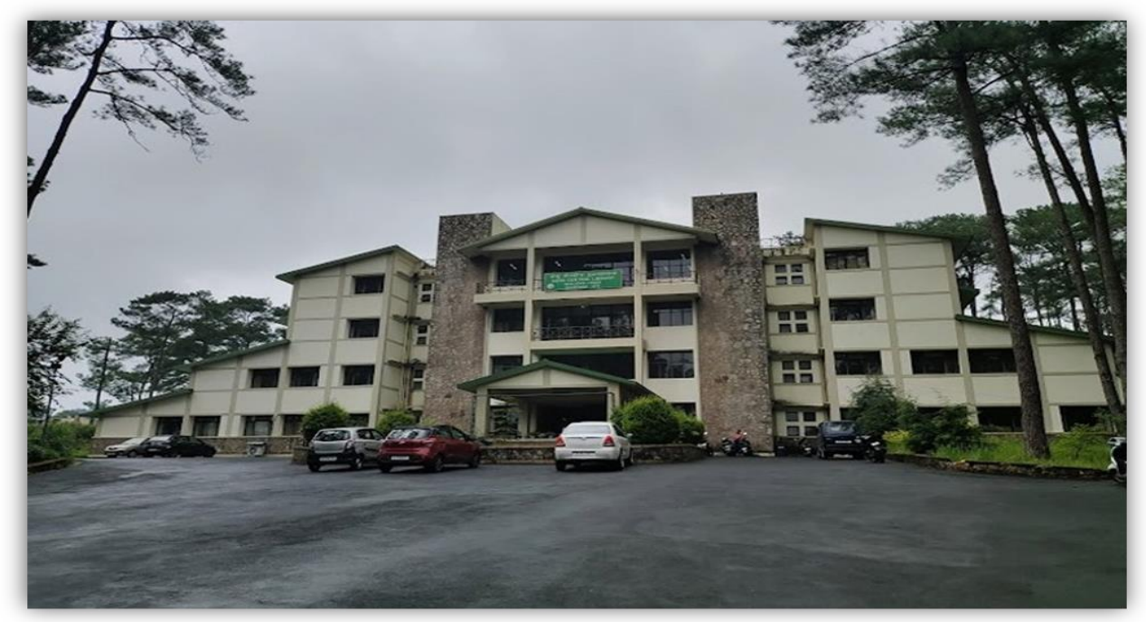
NEHU Central Library

Our students have done well in life after leaving the University. Many have been taken into the Central Civil Services, Banking Services and into the University System. Several have been awarded scholarships and fellowships by both national and foreign organizations. The percentage of our students clearing the NET, GATE and other national tests is quite high. The number of students turning in for their master's degrees and research students working for their M.Phil. and Ph.D. degrees is close to 1700. The undergraduate colleges affiliated to the University enroll about 18,000 students. Our faculty strength is just over 300. In a short span of about 50 years NEHU has matured into an institution with a serious academic and social and cultural agenda and a clear vision for its future growth.