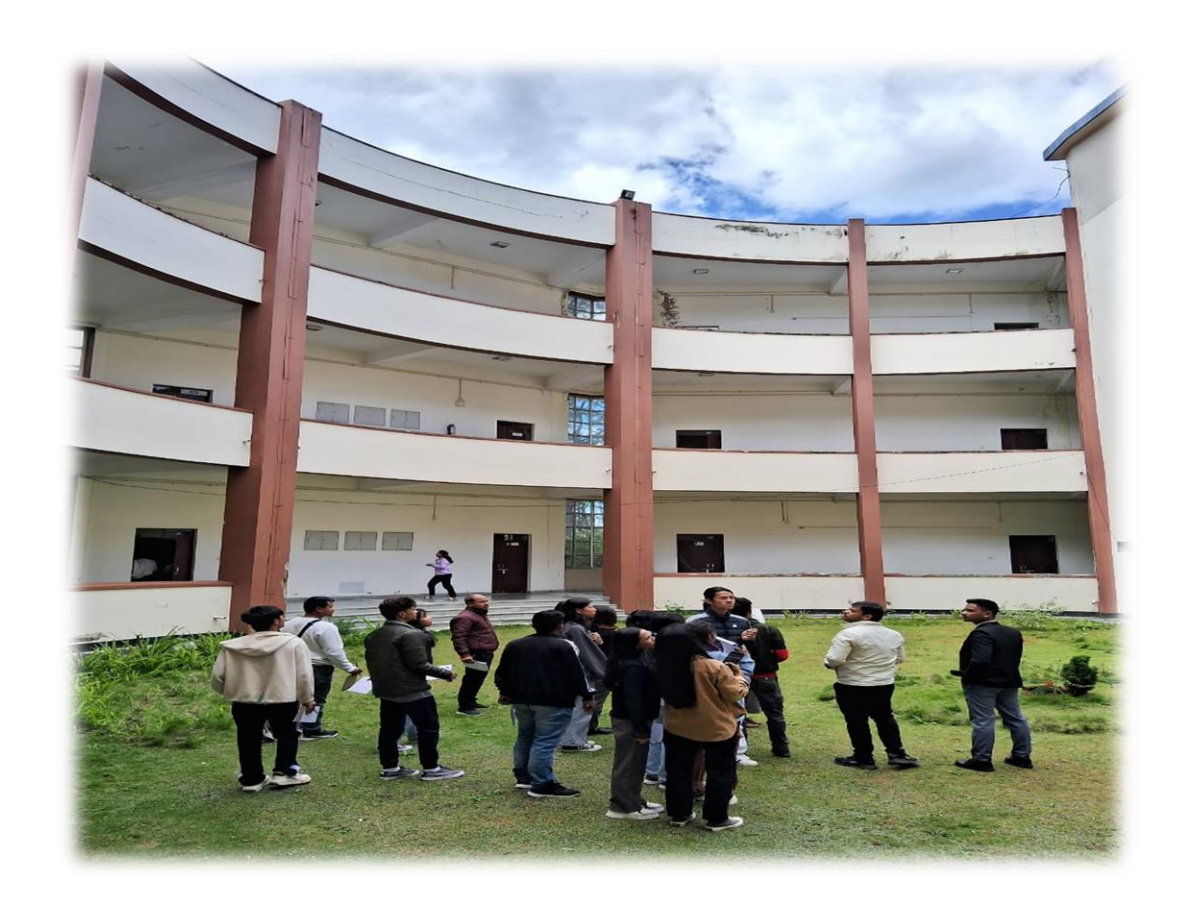
Not Enough Space in the center of the building.