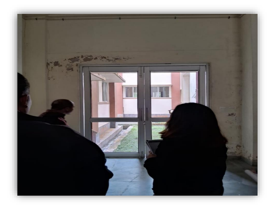
Emergency exits are in the wrong place.