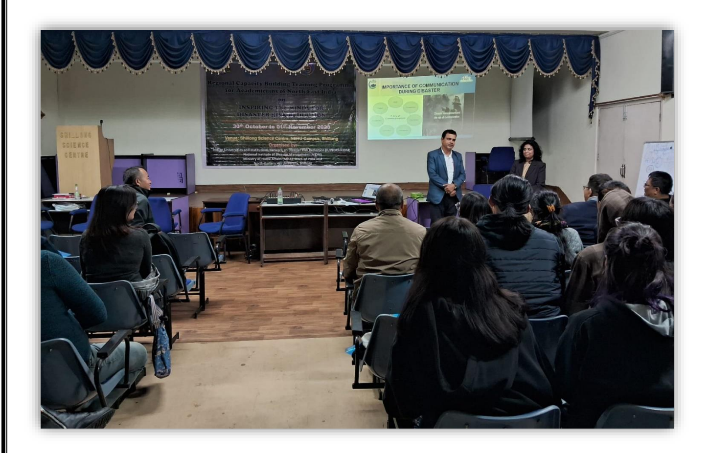
b) Demonstrating the significance of communication during a disaste.