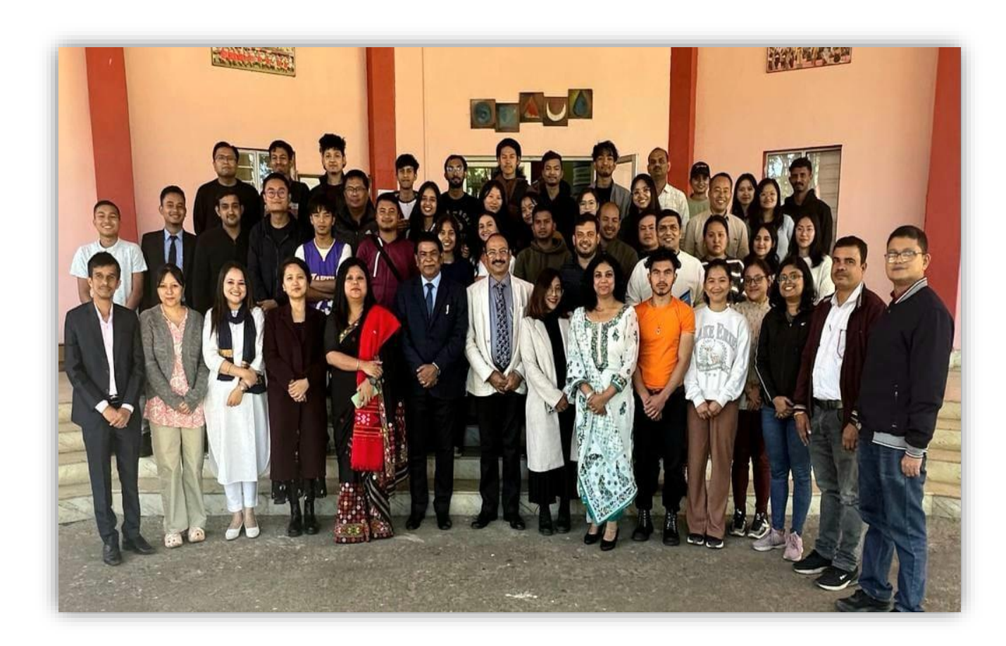
Group Photo @ NEHU