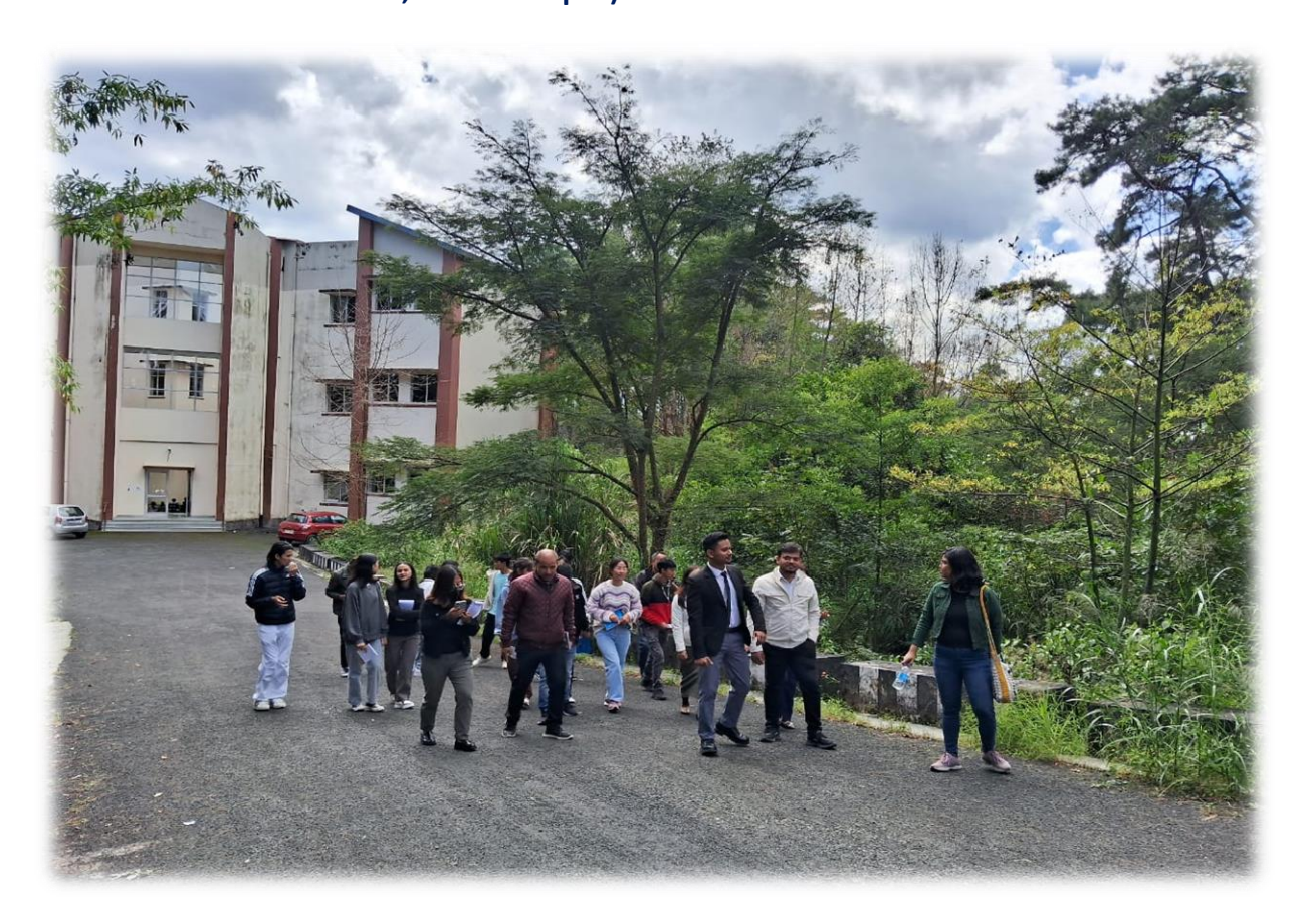
Group A: Architectural and Engineering Aspects of the Buildings of the Campus (Social Science Cluster Classrooms, NEHU Campus).