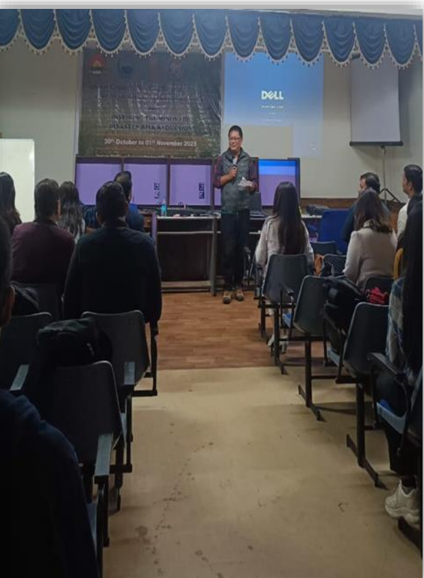
Group A Presentation