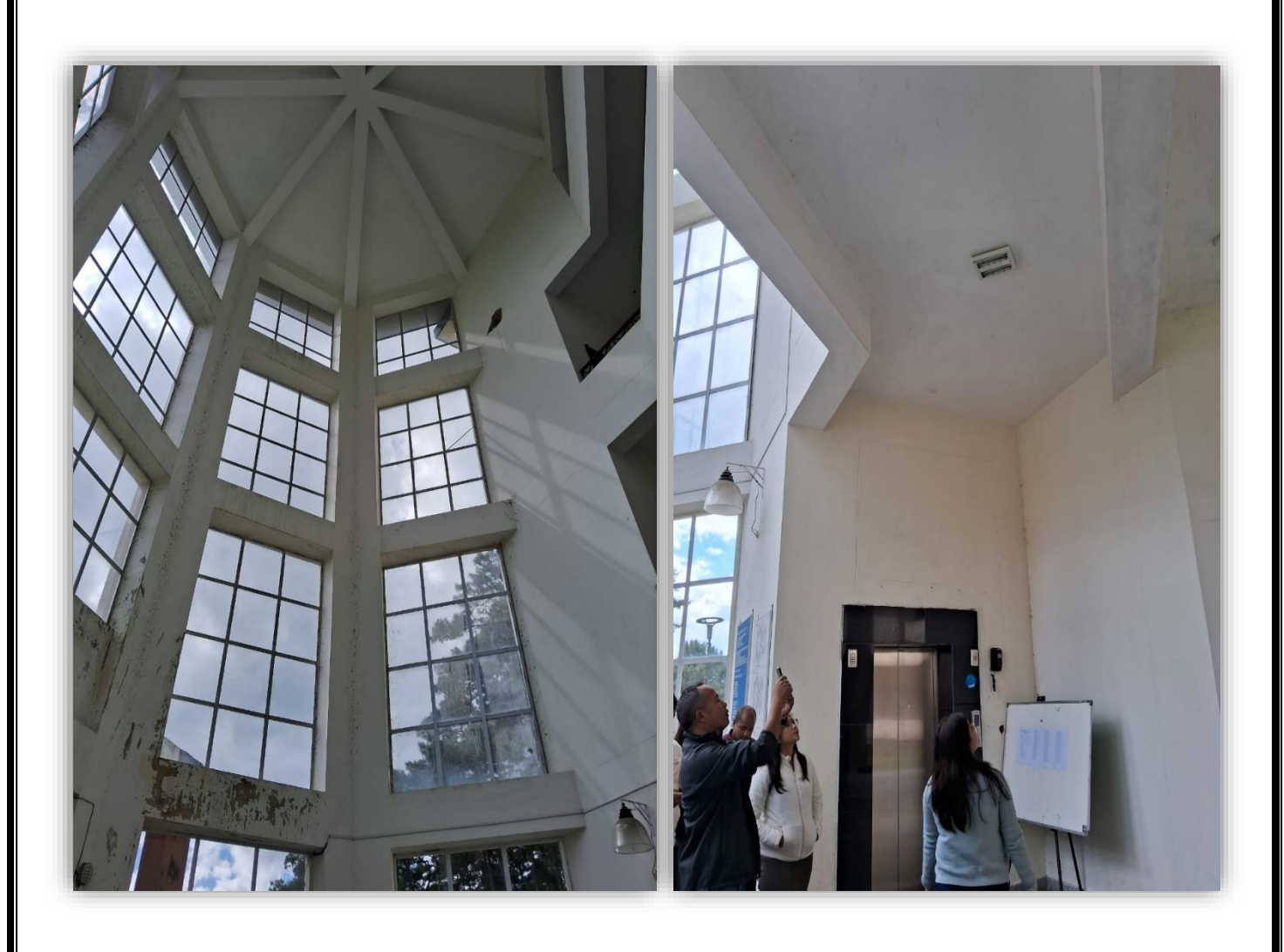
Irregular Joints (should be perpendicular) and Column Joints are not at same angle.