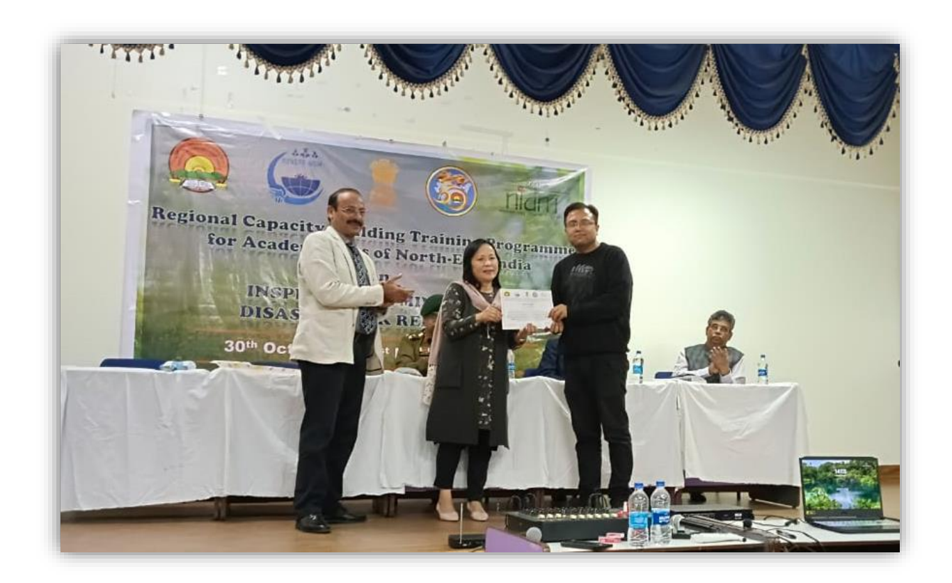
Distribution of Certificates