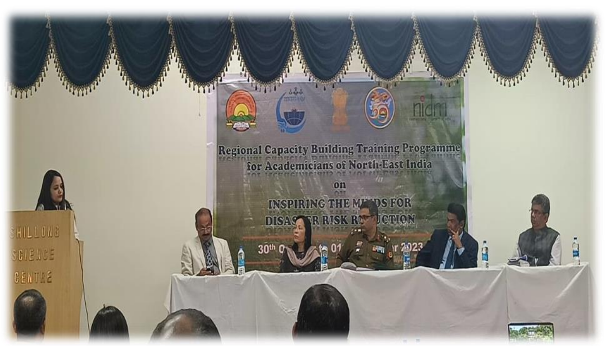
Feedback from the Participants