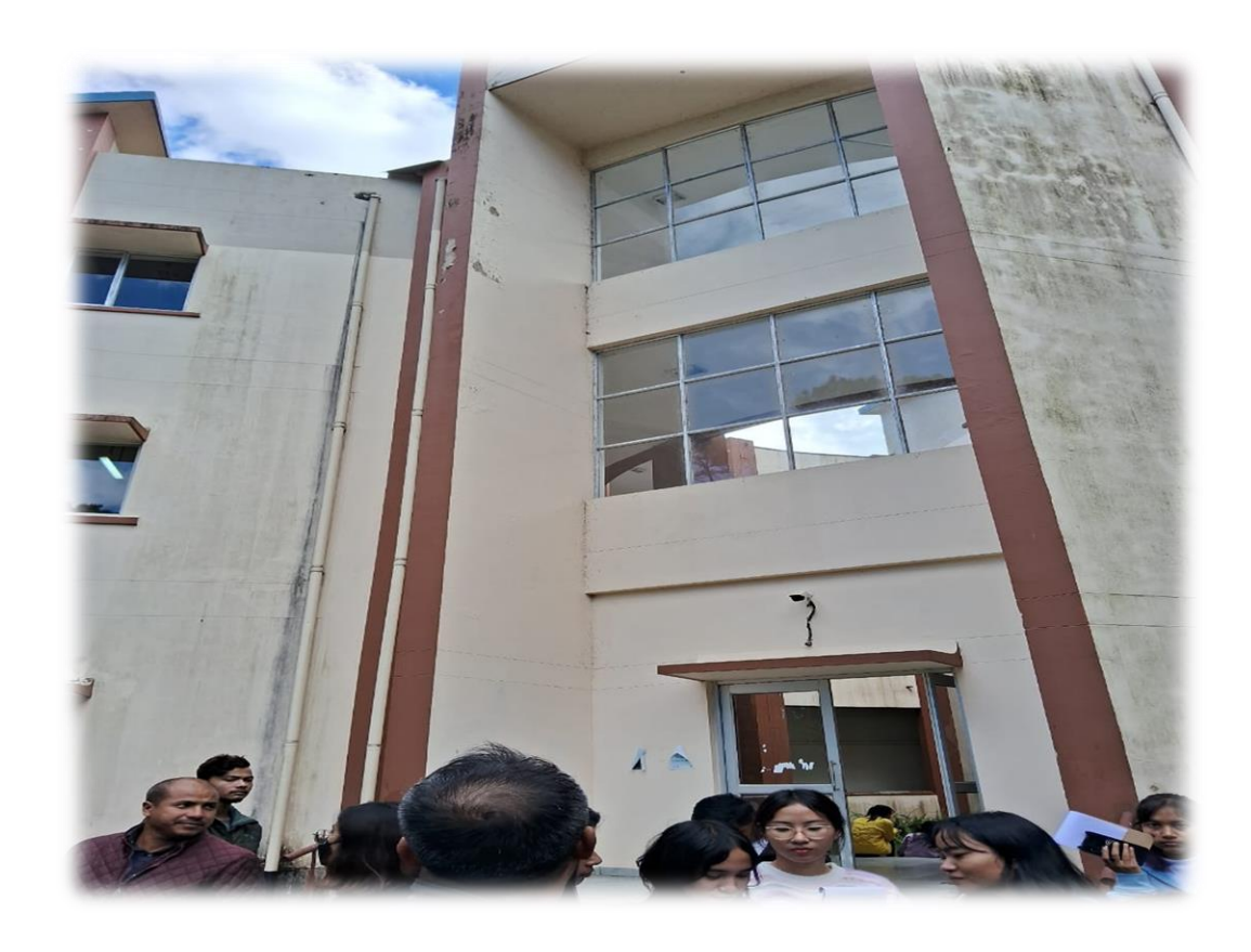
Windowpanes without iron bars.