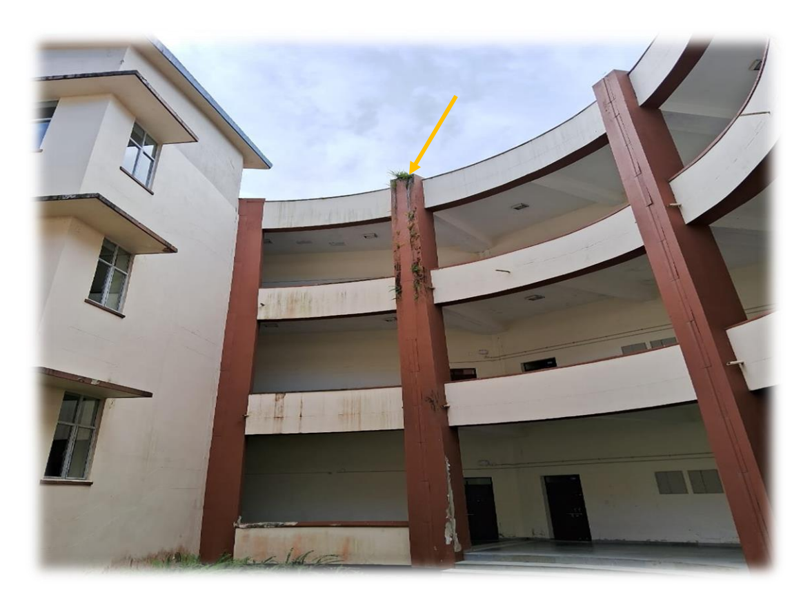
Plants are starting to grow in between the cracks.