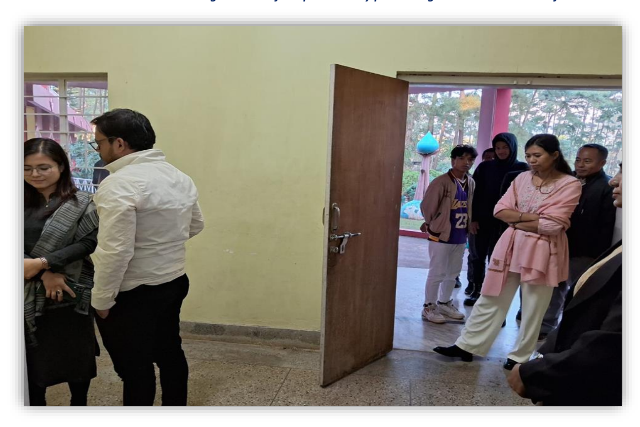
Group Exercise 2: a) Demonstrating the significance of communication during a disaste.r