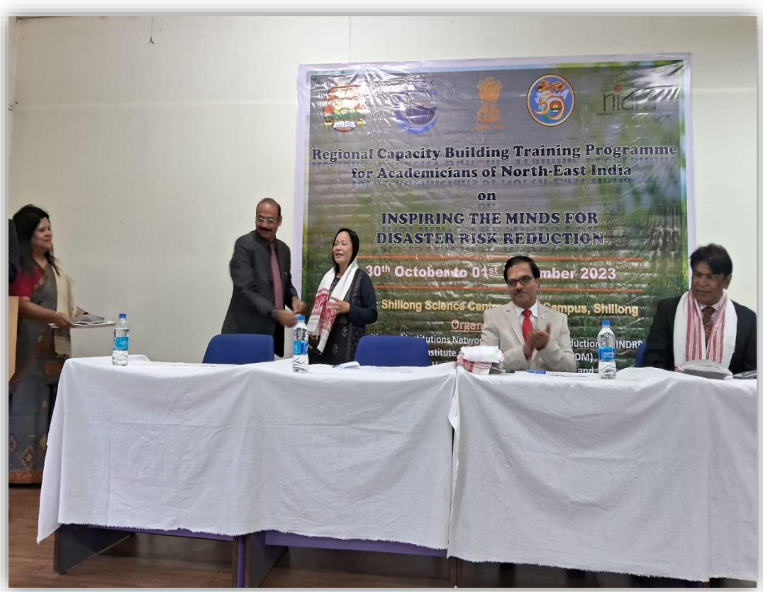
Felicitation of the Esteem Guests