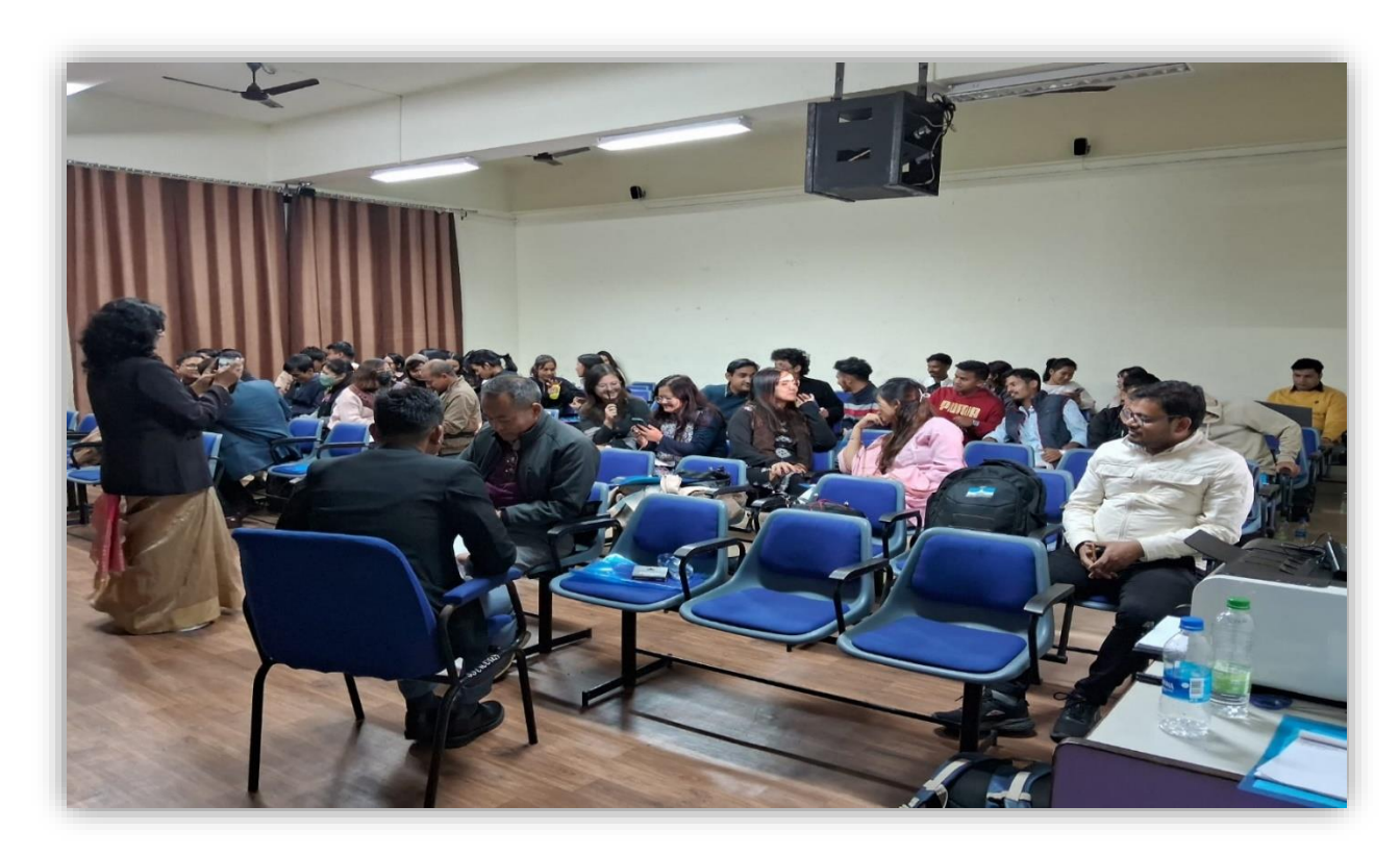
Group Exercise 1: The participants were divided into two groups, A and B, as the Counsellor and the Victim, with the victims communicating their horrific experiences by pretending to be actual victims of a disaster.